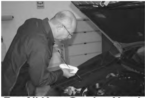
For All Your Service Needs

Your Nissan dealer is a full-service maintenance and repair center. We recommend using authorized Nissan Service and genuine Nissan Parts that we have designed for their reliability, safety and suitability for your Nissan vehicle. We are committed to providing you with quick, efficient, and competitively priced service and parts.